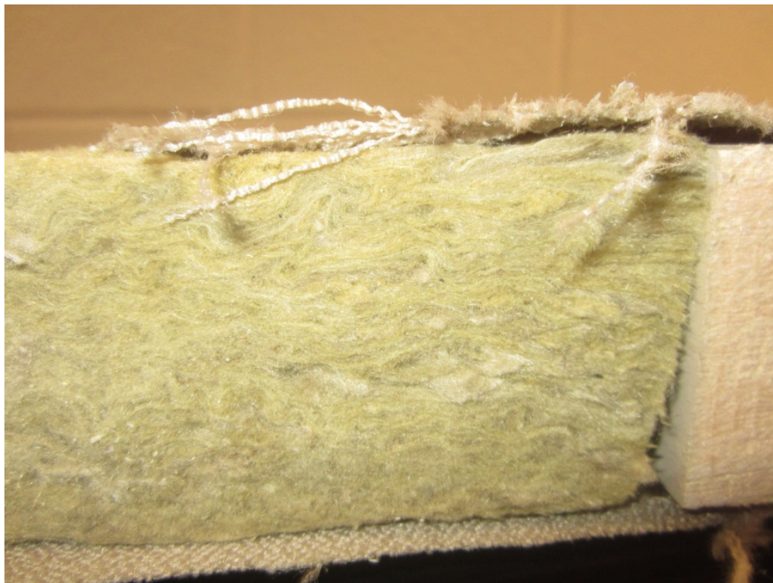
Cross-Cut View of Installed Specimen