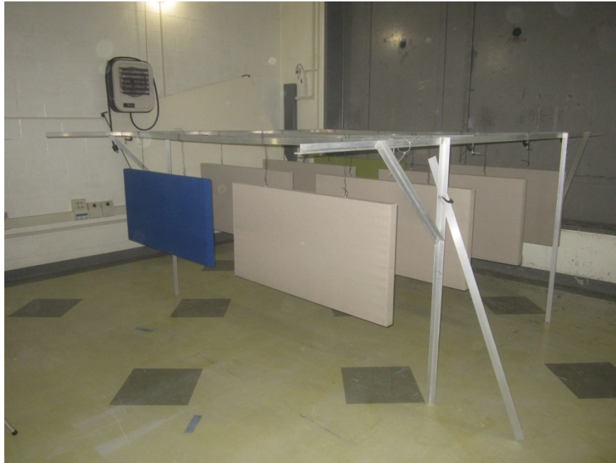
View of Installed Specimen